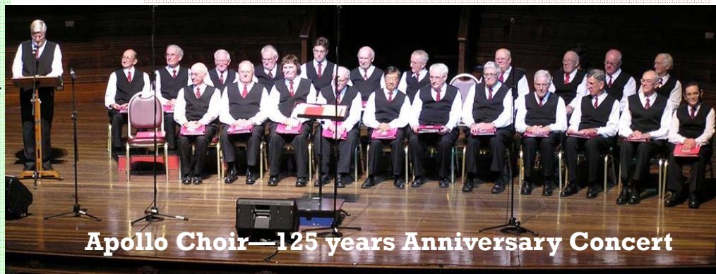
Apollo Choir—125 years Anniversary Concert