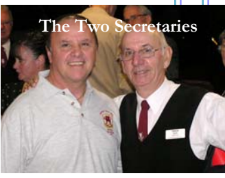
The Two Secretaries

Society is like a stew; if you don't keep it stirred up you get a lot of scum on top.